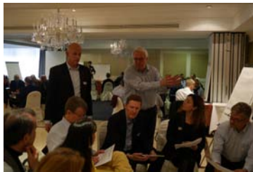
Strategy Workshop Madrid, March 2015