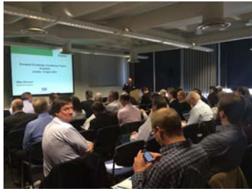
Ecopliant Project London, April 2015