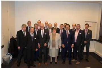
2015 - 2107 Executive Board

surveillance stakeholders has been instrumental in the decision to include LED lamps in the scope of this new project.