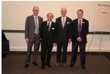
Welcome to our new Presidium