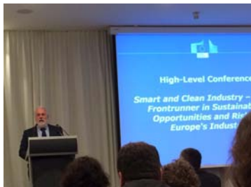
Commission High Level Conference on Energy Brussels, March 2015

www.lightingforpeople.eu , and will be presented at various events, workshops throughout 2015.