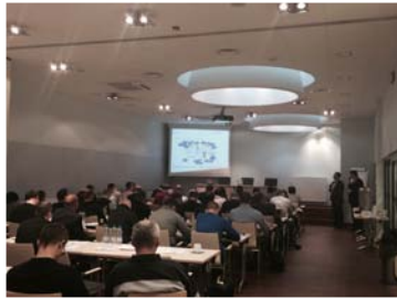
Market Surveillance training, Warsaw February 2015