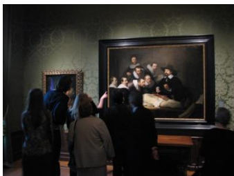
Appreciating the Mauritshuis Museum

situation will affect economical and regulatory framework as well as lighting companies. In this newsletter you find a contribution from our German association member ZVEI with a guide for Reliable Planning with LED lighting in English. I also want to inform you about the final event of the lightingforpeople project that we support. Please, check the agenda and your availability for this special day in Brussels. Wishing you a pleasant summer