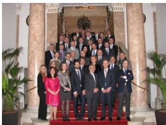
General Assembly, The Hague, May 2016